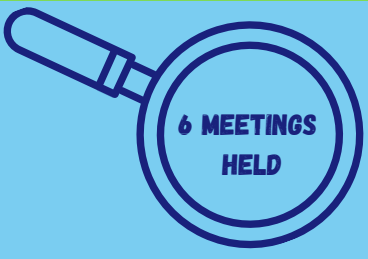
Number of cases considered: